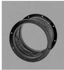
ACOP Round flexible flanged connectors