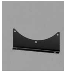
PIE Support Feet