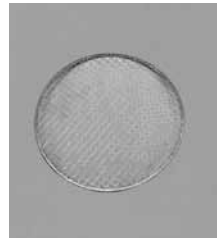
DEF-T Inlet/outlet wire protection guard