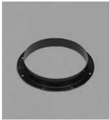
BRIDA Round duct matching flange