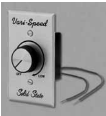
SC 15 Variable speed control