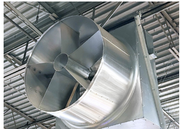
S&P Canada Ventilation Products' CrewCooler™ is an aisle circulator fan that keeps air circulating and employees cool in warehouse facilities.